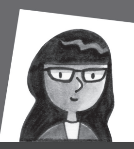
The Baker Street Regulars