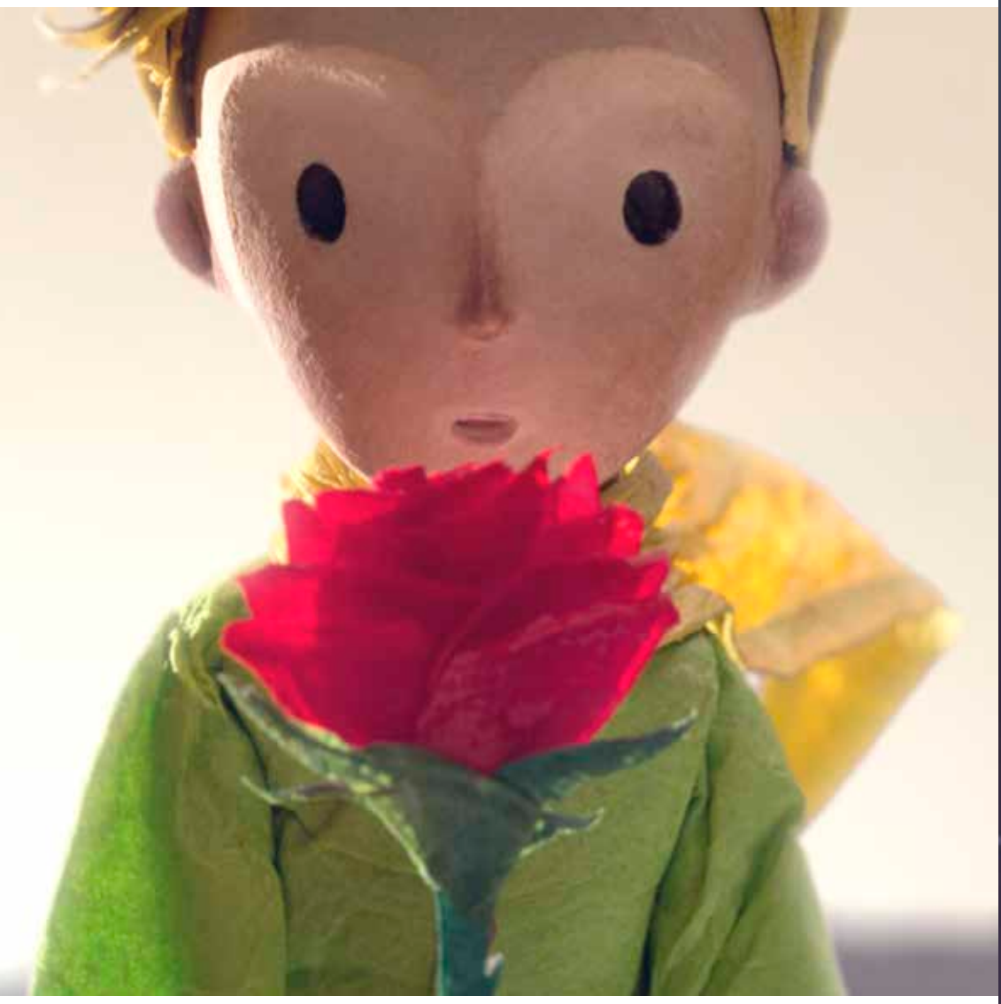
'It's time for breakfast,' the rose said. 'Oh!' said the Little Prince. 'I'm sorry!' He ran for some water.

The Little Prince loved the rose, but the rose was never happy.