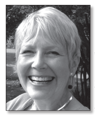
otograph © Joanna Wil