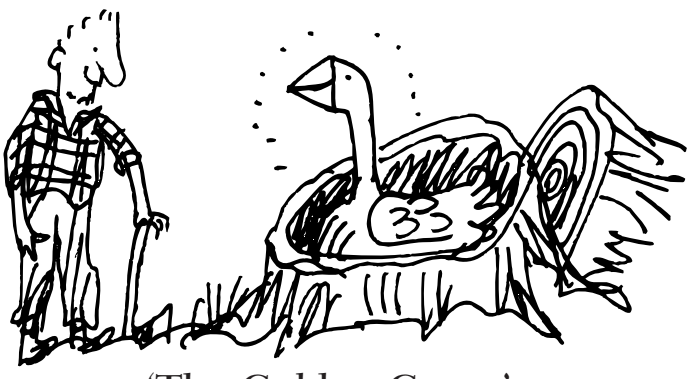
'The Golden Goose'

Some fairy tales are not so well known. Choose the title of a tale you haven't heard before and make up a story to go with it.