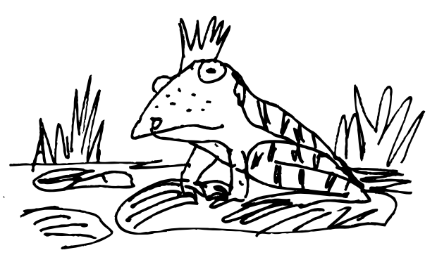
'The Frog Prince'

Some fairy tales are not so well known. Choose the title of a tale you haven't heard before and make up a story to go with it.