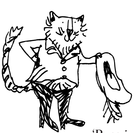
'Puss in Boots'