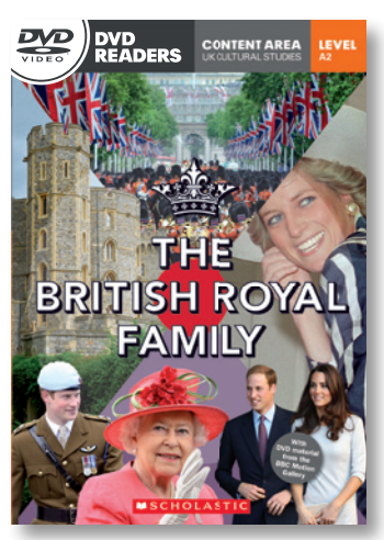
THE BRITISH ROYAL FAMILY