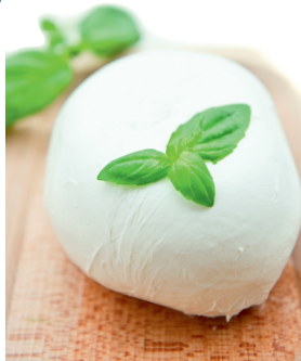
mozzarella (n) (U)