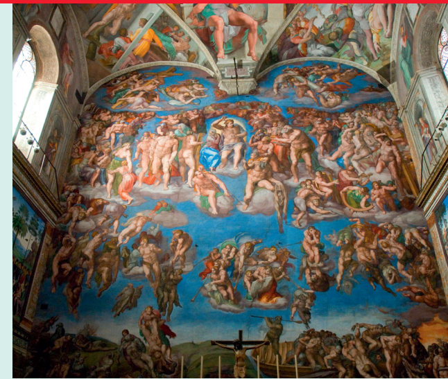
Detail from The Sistine Chapel

Raphael worked with Bramante in Rome and many of his paintings are in the Vatican.