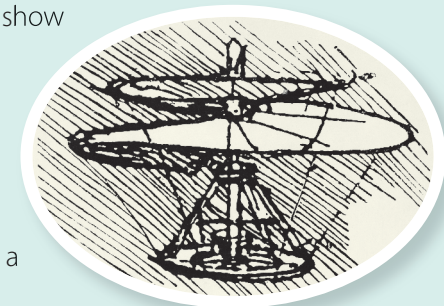
Da Vinci's helicopter drawing

Da Vinci painted some of the most famous paintings in the world, including the Mona Lisa . But da Vinci wasn't only an artist, he was interested in many different subjects. Some of his drawings show his ideas for amazing machines that were far ahead of his time, such as a helicopter.