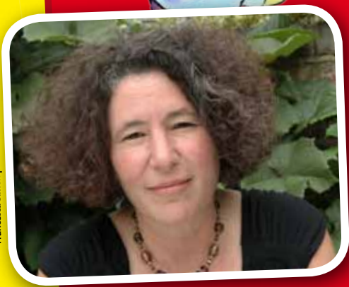
Francesca Simon

Francesca Simon is one of the UK's bestselling children's authors, creating the immensely popular Horrid Henry series which has sold over fifteen million copies. She won the Children's Book of the Year Award in 2008 for Horrid Henry and the Abominable Snowman .